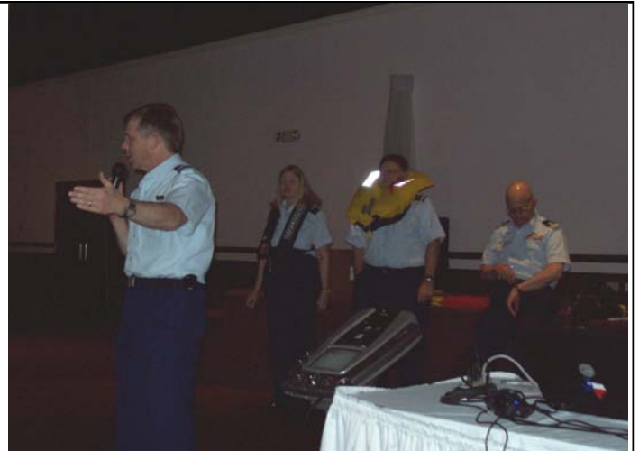
Coast Guard Auxiliary at March ASWSC Meeting

For those of you who asked to learn more about DSC radio capabilities, there is more information available on the BoatUS website: www.boatus.com/mmsi