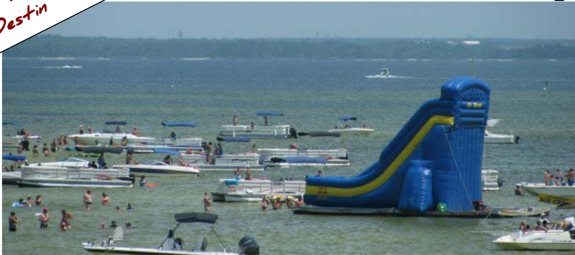
Crab Island Madness