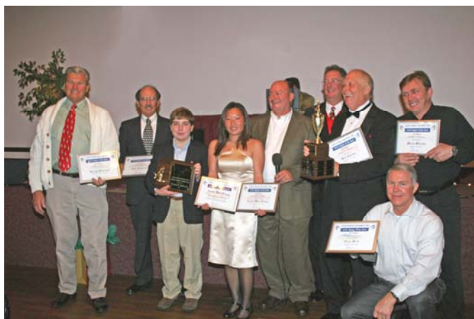
Angler of the Year Award Winners